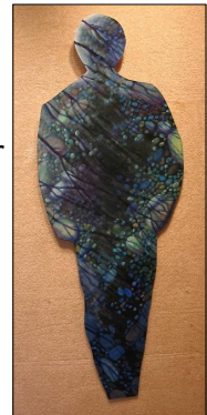
Pond People on Masonite